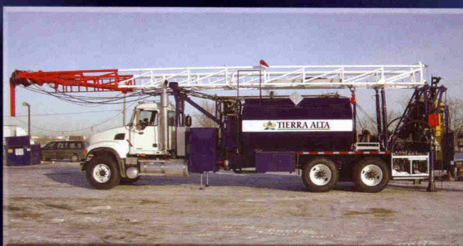
Rapid-Rod Service Unit (RSU)