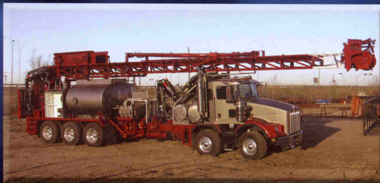
Slant Rapid-Rod Service Unit (RSU)