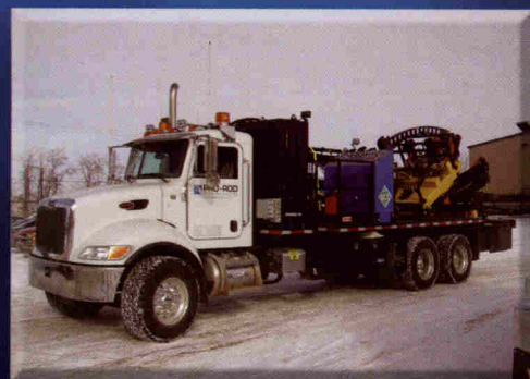
Truck Mounted X-celerator®