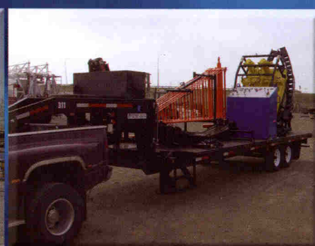
Rig Assist X-celerator® Trailer